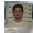
Response to repeated attempts by county judge