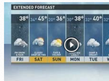
NEWS CENTER Video Forecast