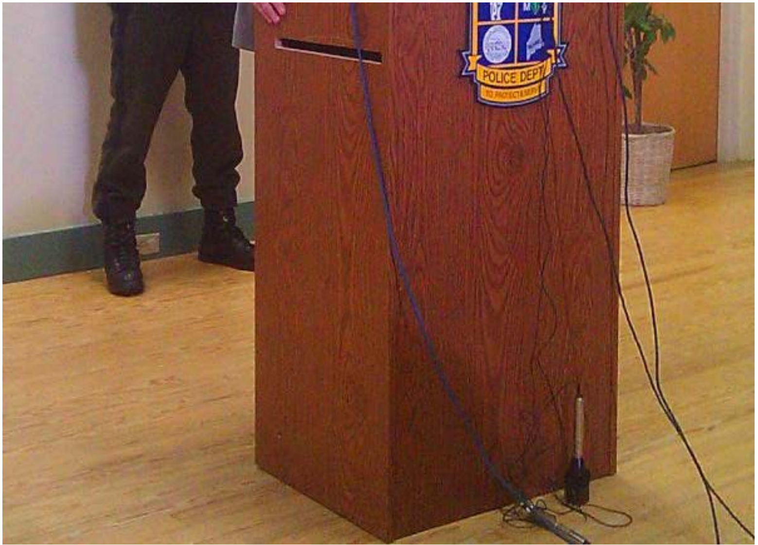
Waterville Police Chief Joseph Massey speaks at today's press conference.